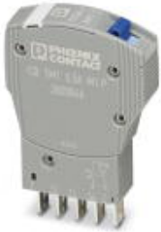
Thermomagnetic device circuit breaker, 1-pos., tripping characteristic M1 (medium-blow), 1 PDT contact, plug for base element.

Please be informed that the data shown in this PDF Document is generated from our Online Catalog. Please find the complete data in the user's documentation. Our General Terms of Use for Downloads are valid ( http://phoenixcontact.com/download )