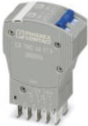
Thermomagnetic device circuit breaker, 2-pos., tripping characteristic F1 (fast-blow), 2 PDT contacts, plug for base element.

Please be informed that the data shown in this PDF Document is generated from our Online Catalog. Please find the complete data in the user's documentation. Our General Terms of Use for Downloads are valid ( http://phoenixcontact.com/download )