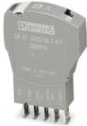
Electronic device circuit breaker, 1-pos., active current limitation, status output and reset input, plug for base element.

Please be informed that the data shown in this PDF Document is generated from our Online Catalog. Please find the complete data in the user's documentation. Our General Terms of Use for Downloads are valid ( http://phoenixcontact.com/download )