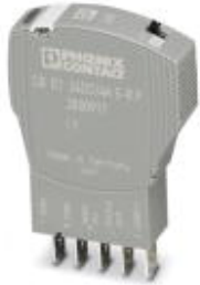
Electronic device circuit breaker, 1-pos., active current limitation, status output and reset input, plug for base element.

Please be informed that the data shown in this PDF Document is generated from our Online Catalog. Please find the complete data in the user's documentation. Our General Terms of Use for Downloads are valid ( http://phoenixcontact.com/download )