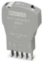
Electronic device circuit breaker, 1-pos., active current limitation, 1 N/C contact, plug for base element.

Please be informed that the data shown in this PDF Document is generated from our Online Catalog. Please find the complete data in the user's documentation. Our General Terms of Use for Downloads are valid ( http://phoenixcontact.com/download )