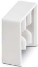
End cover for lateral connection of wiring bridges, 3-phase

Please be informed that the data shown in this PDF Document is generated from our Online Catalog. Please find the complete data in the user's documentation. Our General Terms of Use for Downloads are valid ( http://phoenixcontact.com/download )