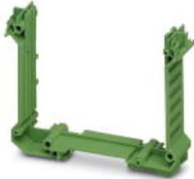
Component housing with vents, Lower part, Color: green, Width: 22.5 mm

Please be informed that the data shown in this PDF Document is generated from our Online Catalog. Please find the complete data in the user's documentation. Our General Terms of Use for Downloads are valid ( http://phoenixcontact.com/download )