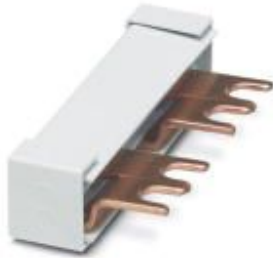
Wiring bridge for modules with connecting pitch 17.5 mm, 2-phase, 4-pos.

Please be informed that the data shown in this PDF Document is generated from our Online Catalog. Please find the complete data in the user's documentation. Our General Terms of Use for Downloads are valid ( http://phoenixcontact.com/download )