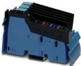
Inline power terminal for power supply to intrinsically safe I/O terminals

Please be informed that the data shown in this PDF Document is generated from our Online Catalog. Please find the complete data in the user's documentation. Our General Terms of Use for Downloads are valid ( http://phoenixcontact.com/download )