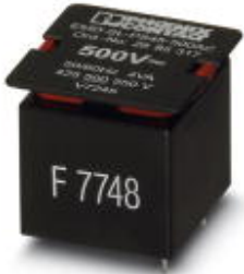
Power modules, pluggable, for EMD-FL-..., supply voltage: 425...550 V AC

Please be informed that the data shown in this PDF Document is generated from our Online Catalog. Please find the complete data in the user's documentation. Our General Terms of Use for Downloads are valid ( http://phoenixcontact.com/download )