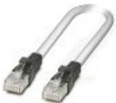
Patch cable, CAT5, assembled, 5 m

Patch cable - FL CAT5 PATCH 5,0 - 2832580