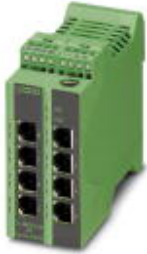
Ethernet Lean Managed Switch with eight 10/100 Mbps RJ45 ports, preconfigured for EtherNet/IP™

Please be informed that the data shown in this PDF Document is generated from our Online Catalog. Please find the complete data in the user's documentation. Our General Terms of Use for Downloads are valid ( http://phoenixcontact.com/download )