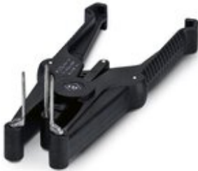
Assembly tool for FL IP 54 SPOUT

Please be informed that the data shown in this PDF Document is generated from our Online Catalog. Please find the complete data in the user's documentation. Our General Terms of Use for Downloads are valid ( http://phoenixcontact.com/download )