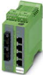
Ethernet Lean Managed Switch with four 10/100 Mbps RJ45 ports and two 100 Mbps FX-SC single-mode ports

Please be informed that the data shown in this PDF Document is generated from our Online Catalog. Please find the complete data in the user's documentation. Our General Terms of Use for Downloads are valid ( http://phoenixcontact.com/download )