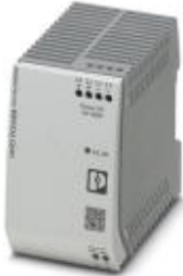
Primary-switched UNO POWER power supply for DIN rail mounting, input: 1-phase, output: 15 V DC/100 W

Please be informed that the data shown in this PDF Document is generated from our Online Catalog. Please find the complete data in the user's documentation. Our General Terms of Use for Downloads are valid ( http://phoenixcontact.com/download )