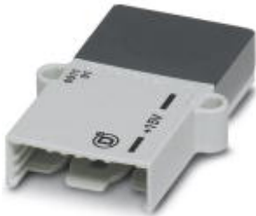
SmartWire DT™ bus termination plug

Please be informed that the data shown in this PDF Document is generated from our Online Catalog. Please find the complete data in the user's documentation. Our General Terms of Use for Downloads are valid ( http://phoenixcontact.com/download )