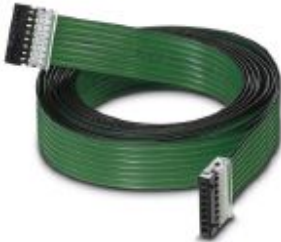
SmartWire DT™ 3 m flat-ribbon conductor, assembled with 2 flat plugs, 8-pos.

Please be informed that the data shown in this PDF Document is generated from our Online Catalog. Please find the complete data in the user's documentation. Our General Terms of Use for Downloads are valid ( http://phoenixcontact.com/download )