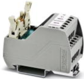
VARIOFACE Professional (VIP) board for the ROC800 controller

Please be informed that the data shown in this PDF Document is generated from our Online Catalog. Please find the complete data in the user's documentation. Our General Terms of Use for Downloads are valid ( http://phoenixcontact.com/download )