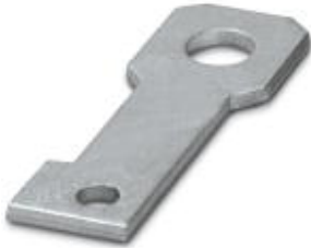
Plate for fixing the FLT-ISG-100-EX isolating spark gap to a flange, drill hole diameter of 18 mm.

Please be informed that the data shown in this PDF Document is generated from our Online Catalog. Please find the complete data in the user's documentation. Our General Terms of Use for Downloads are valid ( http://phoenixcontact.com/download )