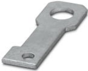
Plate for fixing the FLT-ISG-100-EX isolating spark gap to a flange, drill hole diameter of 22 mm.

Please be informed that the data shown in this PDF Document is generated from our Online Catalog. Please find the complete data in the user's documentation. Our General Terms of Use for Downloads are valid ( http://phoenixcontact.com/download )