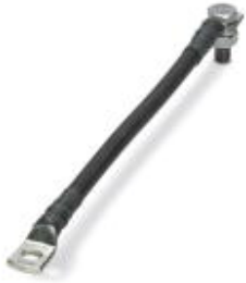
Connecting cable for FLT-ISG-100-EX, length 200 mm.

Please be informed that the data shown in this PDF Document is generated from our Online Catalog. Please find the complete data in the user's documentation. Our General Terms of Use for Downloads are valid ( http://phoenixcontact.com/download )