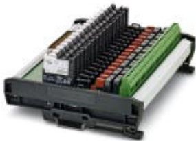
VARIOFACE 16-channel module intended for use with Honeywell® Experion C300 24 V digital IOTA, left-hand version, 3 A, 120 V

Please be informed that the data shown in this PDF Document is generated from our Online Catalog. Please find the complete data in the user's documentation. Our General Terms of Use for Downloads are valid ( http://phoenixcontact.com/download )