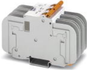
Thermomagnetic device circuit breaker, number of positions: 3, width: 52.9 mm, mounting type: DIN rail, Color: gray

Please be informed that the data shown in this PDF Document is generated from our Online Catalog. Please find the complete data in the user's documentation. Our General Terms of Use for Downloads are valid ( http://phoenixcontact.com/download )