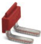
Insertion bridge, pitch: 6.15 mm, number of positions: 2, color: red

Insertion bridge - EB 2- DIK RD - 2716693