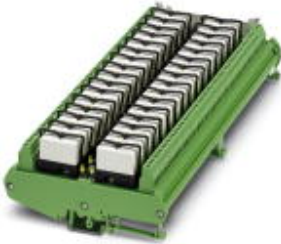
Varioface output module, with 32 miniature relays, 1 PDT, plugged, for 24 V DC (incl. relay)

Please be informed that the data shown in this PDF Document is generated from our Online Catalog. Please find the complete data in the user's documentation. Our General Terms of Use for Downloads are valid ( http://phoenixcontact.com/download )