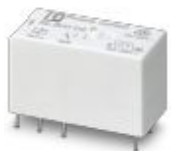
Plug-in miniature power relay, with power contact for high continuous currents, 1 PDT, input voltage 24 V DC

Single relay - REL-MR- 24DC/21HC - 2961312