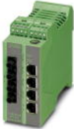
Ethernet Lean Managed Switch with four 10/100 Mbps RJ45 ports and two 100 Mbps FX-ST single-mode ports

Please be informed that the data shown in this PDF Document is generated from our Online Catalog. Please find the complete data in the user's documentation. Our General Terms of Use for Downloads are valid ( http://phoenixcontact.com/download )