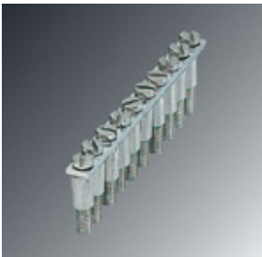
Fixed bridge, pitch: 5 mm, number of positions: 10, color: silver

Please be informed that the data shown in this PDF Document is generated from our Online Catalog. Please find the complete data in the user's documentation. Our General Terms of Use for Downloads are valid ( http://phoenixcontact.com/download )