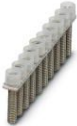
Jumper, number of positions: 10, color: silver

Please be informed that the data shown in this PDF Document is generated from our Online Catalog. Please find the complete data in the user's documentation. Our General Terms of Use for Downloads are valid ( http://phoenixcontact.com/download )