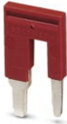
Reducing bridge, pitch: 9.5 mm, length: 24.6 mm, width: 14.5 mm, number of positions: 2, color: red

Please be informed that the data shown in this PDF Document is generated from our Online Catalog. Please find the complete data in the user's documentation. Our General Terms of Use for Downloads are valid ( http://phoenixcontact.com/download )