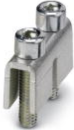
Fixed bridge, number of positions: 2, color: silver

Please be informed that the data shown in this PDF Document is generated from our Online Catalog. Please find the complete data in the user's documentation. Our General Terms of Use for Downloads are valid ( http://phoenixcontact.com/download )