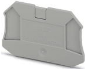
End cover, length: 64.4 mm, width: 2.2 mm, height: 42.3 mm, color: gray

Please be informed that the data shown in this PDF Document is generated from our Online Catalog. Please find the complete data in the user's documentation. Our General Terms of Use for Downloads are valid ( http://phoenixcontact.com/download )