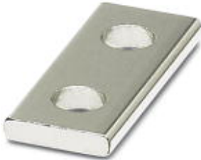
Connection element, length: 41 mm, width: 20 mm, height: 4 mm, number of positions: 2, color: silver

Please be informed that the data shown in this PDF Document is generated from our Online Catalog. Please find the complete data in the user's documentation. Our General Terms of Use for Downloads are valid ( http://phoenixcontact.com/download )