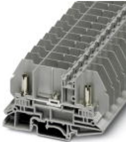
Test disconnect terminal block, cross section: 0.1 - 6 mm 2 , AWG: 26 - 8, width 13 mm, color: gray

Please be informed that the data shown in this PDF Document is generated from our Online Catalog. Please find the complete data in the user's documentation. Our General Terms of Use for Downloads are valid ( http://phoenixcontact.com/download )