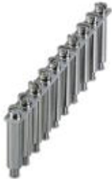
Fixed bridge, pitch: 9 mm, number of positions: 10, color: silver

Please be informed that the data shown in this PDF Document is generated from our Online Catalog. Please find the complete data in the user's documentation. Our General Terms of Use for Downloads are valid ( http://phoenixcontact.com/download )