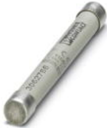
Fuse, 10.3 mm x 85 mm, up to 1500 V DC, gPV characteristic

Please be informed that the data shown in this PDF Document is generated from our Online Catalog. Please find the complete data in the user's documentation. Our General Terms of Use for Downloads are valid ( http://phoenixcontact.com/download )