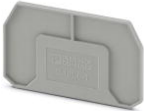
End cover, length: 66.5 mm, width: 2.2 mm, height: 37.9 mm, color: gray

Please be informed that the data shown in this PDF Document is generated from our Online Catalog. Please find the complete data in the user's documentation. Our General Terms of Use for Downloads are valid ( http://phoenixcontact.com/download )