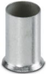
Ferrule, length: 12 mm, color: silver

Please be informed that the data shown in this PDF Document is generated from our Online Catalog. Please find the complete data in the user's documentation. Our General Terms of Use for Downloads are valid ( http://phoenixcontact.com/download )