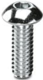
Screws for crimping machine

Please be informed that the data shown in this PDF Document is generated from our Online Catalog. Please find the complete data in the user's documentation. Our General Terms of Use for Downloads are valid ( http://phoenixcontact.com/download )