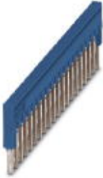
Plug-in bridge, pitch: 3.5 mm, number of positions: 20, color: blue

Please be informed that the data shown in this PDF Document is generated from our Online Catalog. Please find the complete data in the user's documentation. Our General Terms of Use for Downloads are valid ( http://phoenixcontact.com/download )