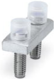
Fixed bridge, pitch: 20 mm, number of positions: 2, color: silver

Please be informed that the data shown in this PDF Document is generated from our Online Catalog. Please find the complete data in the user's documentation. Our General Terms of Use for Downloads are valid ( http://phoenixcontact.com/download )