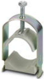
Cable clamp, for DIN rails

Please be informed that the data shown in this PDF Document is generated from our Online Catalog. Please find the complete data in the user's documentation. Our General Terms of Use for Downloads are valid ( http://phoenixcontact.com/download )