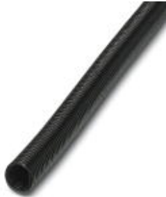
Polyamide protective hose, inflammability class V0, UV resistant

Please be informed that the data shown in this PDF Document is generated from our Online Catalog. Please find the complete data in the user's documentation. Our General Terms of Use for Downloads are valid ( http://phoenixcontact.com/download )