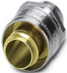
Cable gland made from brass with metric thread, rotatable, IP40 protection

Please be informed that the data shown in this PDF Document is generated from our Online Catalog. Please find the complete data in the user's documentation. Our General Terms of Use for Downloads are valid ( http://phoenixcontact.com/download )