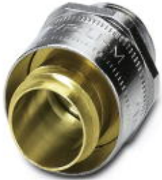
Cable gland made from brass with metric thread, rotatable, IP40 protection

Please be informed that the data shown in this PDF Document is generated from our Online Catalog. Please find the complete data in the user's documentation. Our General Terms of Use for Downloads are valid ( http://phoenixcontact.com/download )