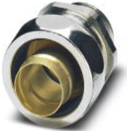
Cable gland made from brass with metric thread, IP65 protection

Please be informed that the data shown in this PDF Document is generated from our Online Catalog. Please find the complete data in the user's documentation. Our General Terms of Use for Downloads are valid ( http://phoenixcontact.com/download )