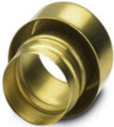
End sleeves as cable protection, made of brass, for WP-STEEL PVC C

Please be informed that the data shown in this PDF Document is generated from our Online Catalog. Please find the complete data in the user's documentation. Our General Terms of Use for Downloads are valid ( http://phoenixcontact.com/download )