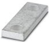
Connection rail, number of positions: 2, color: silver