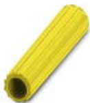
Insulating sleeve, color: yellow