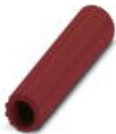
Insulating sleeve, color: red