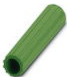
Insulating sleeve, color: green