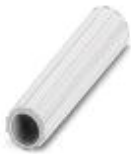
Insulating sleeve, color: white