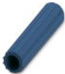
Insulating sleeve, color: blue