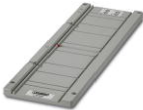
Magazine, for CMS-P1-PLOTTER, for accommodating UC1-TM..., UC1U-TM...

Please be informed that the data shown in this PDF Document is generated from our Online Catalog. Please find the complete data in the user's documentation. Our General Terms of Use for Downloads are valid ( http://phoenixcontact.com/download )