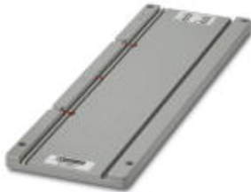
Magazine, for CMS-P1-PLOTTER and PLOTMARK, for accommodating UC-EMP..., UC-EMLP...

Please be informed that the data shown in this PDF Document is generated from our Online Catalog. Please find the complete data in the user's documentation. Our General Terms of Use for Downloads are valid ( http://phoenixcontact.com/download )