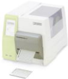
Cutter, for the THERMOMARK ROLL X1

Please be informed that the data shown in this PDF Document is generated from our Online Catalog. Please find the complete data in the user's documentation. Our General Terms of Use for Downloads are valid ( http://phoenixcontact.com/download )